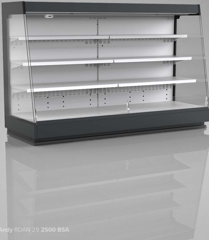
Andy RDAN 29 2500 BSA

DDS – door | double, straight | sliding (sideways) BSA – low glass or front glass riser | single, straight | fixed